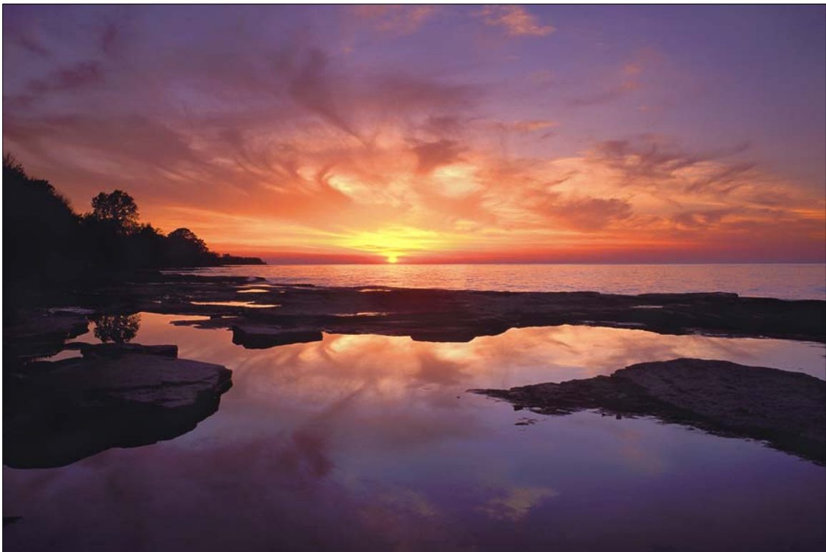
Lake Ontario Sunset