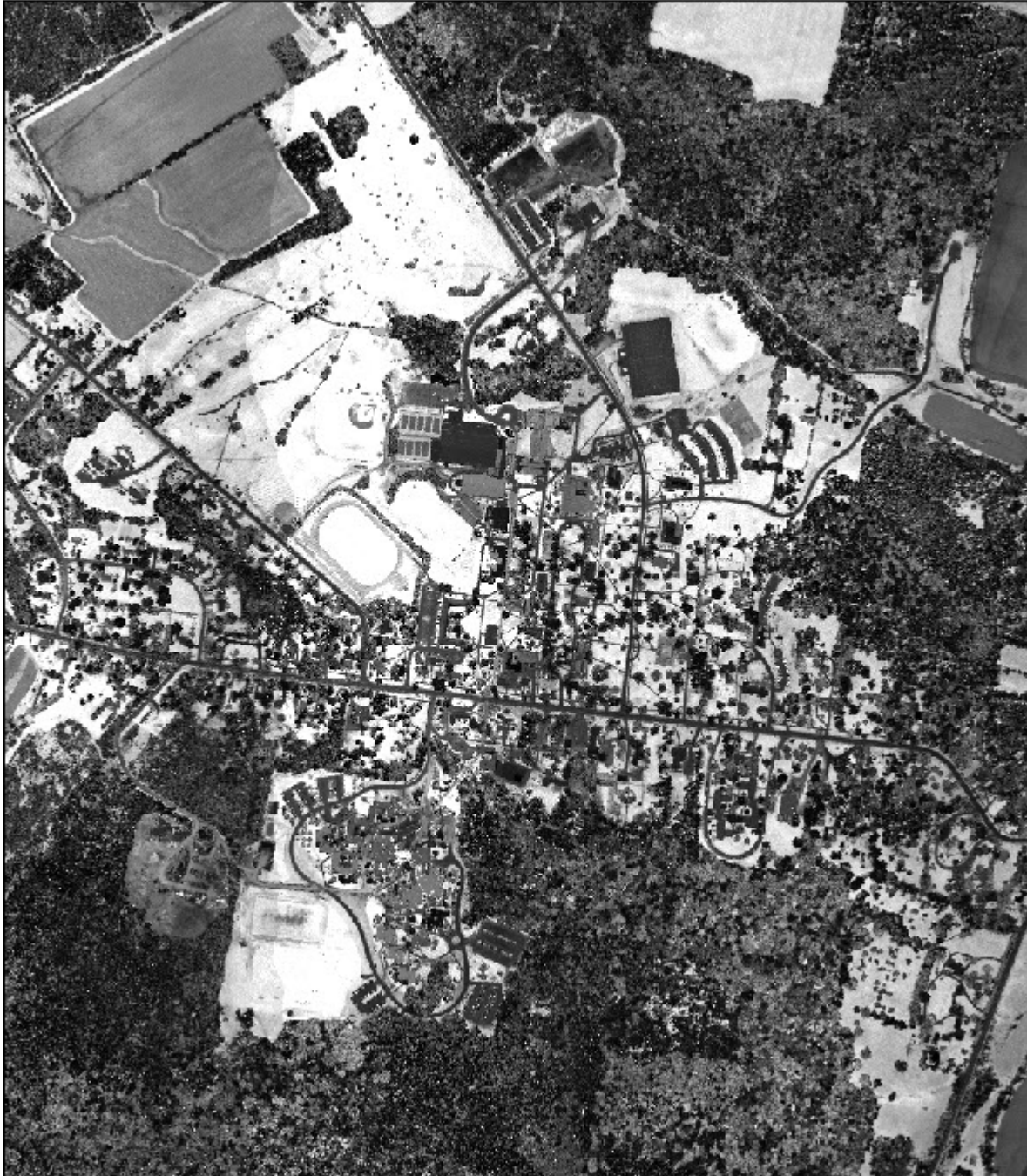
Intensity image derived from first return LiDAR data. Cell size is 2 meters and the intensity values are the mean of values in the BLOB intensity attribute recorded in the multipoint file. Raster created using point to raster tool from the multi-point file.